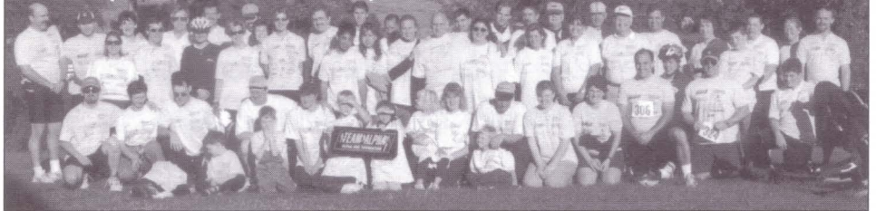
Team Alpha at The Autumn Escape, 2000

NOTE: Please notify your AlphaNet Coordinator of any changes in your health status, insurance coverage, nursing services, and/or pharmacy concerns.