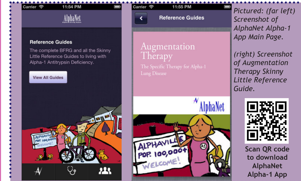
Pictured: (far left) Screenshot of AlphaNet Alpha-1 App Main Page.

An App for physicians who treat patients with Alpha-1 is currently in development.